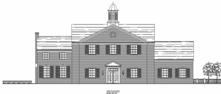
HARDING TOWNSHIP LIBRARY

4,428 square feet. The Library's floor plan has been designed to accommodate all services on one level, enabling us to keep staffing costs to a minimum. See view of proposed front of building: